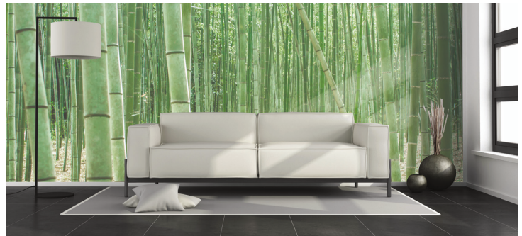
Photo wallpaper, on the other hand, looks best with a high-gloss finish that makes the colors pop. Give your customers realistic photo images that inspire.