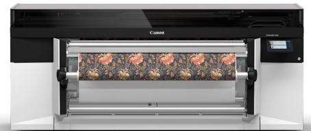
Colorado 1650 Printer